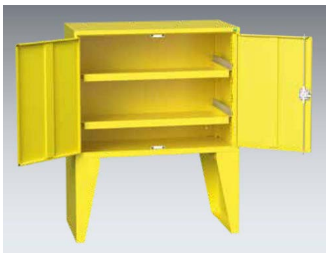
800mm high cupboard shown on optional support legs