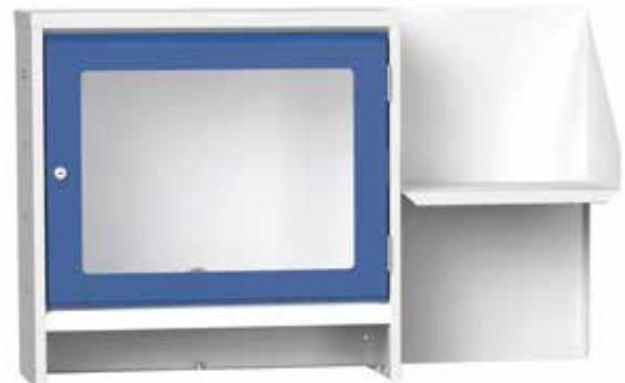
Optional file holding shelf for 1050w enclosed model