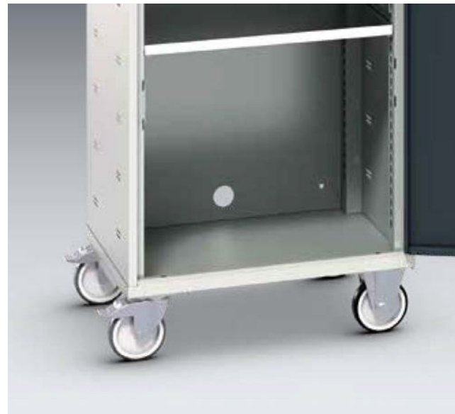
Mobility kit for all 650mm wide models.