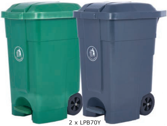
2 x LPB70Y