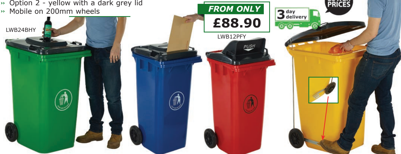
Wheeled Bin with Bottle Hole Lid