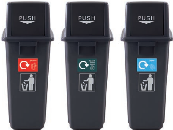
RCY63Z Set of 3