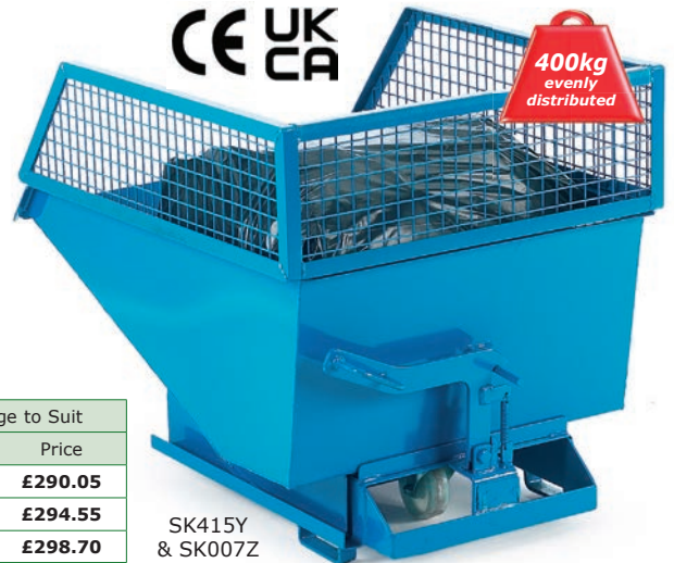
SK415Y & SK007Z