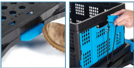
Brake Mechanism Box Fixing Mechanism