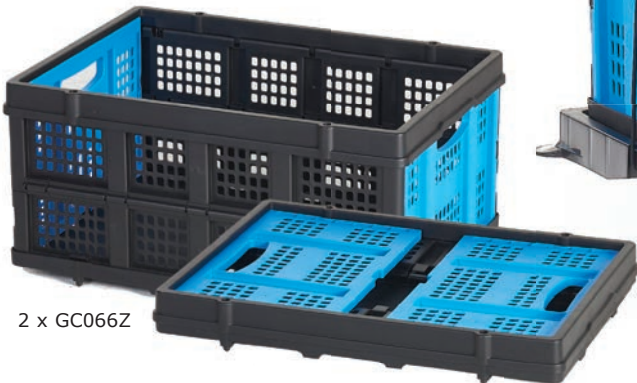
2 x GC066Z