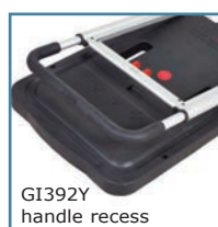
GI392Y handle recess