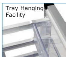
Tray Hanging Facility