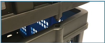
Folding Box Male & Female Connectors