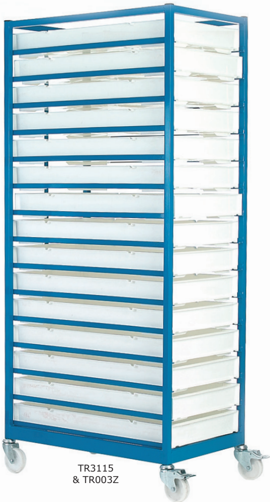
TR3115 & TR003Z