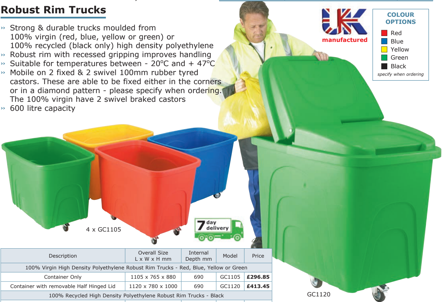
4 x GC1105